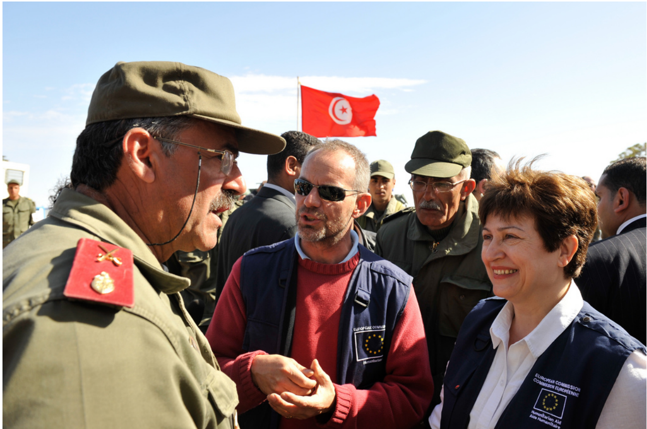
EU Commissioner for Humanitarian Aid Kristalina Georgieva visits camp in Raz Ajdir, Tunisia

Meanwhile, EU institutions have focused on security sector reform, including assistance in drawing up and implementing a programme to provide independent oversight of the police, and developing the investigative capacity of security services under the rule of law. Belgium, Norway, and Japan have supported a UN Development Programme pilot project to rebuild trust between the citizens and police through the development of community-focused police stations. [20] The EU, along with France, has supported the modernisation of Tunisia's judiciary, improving its capacity to prosecute terrorism cases. [21]