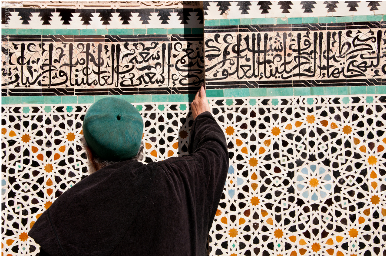
Moroccan imam in Fez

Indeed, counter-radicalisation remains Morocco's weak point. The fact that the security services have thwarted a high number of terrorist plots reflects their capacity to detect and prevent attacks, but it also indicates the extent to which many young men and women remain susceptible to extremist messaging. In an all too familiar pattern repeated across the world, the government points to the tactical successes of its counter-terrorism operations while downplaying the underlying conditions that necessitate these operations.